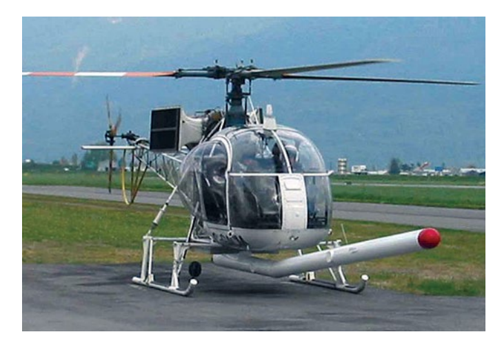
High-resolution magnetometer aerofoil installed on a EUROCOPTER AS315B LAMA HELICOPTER