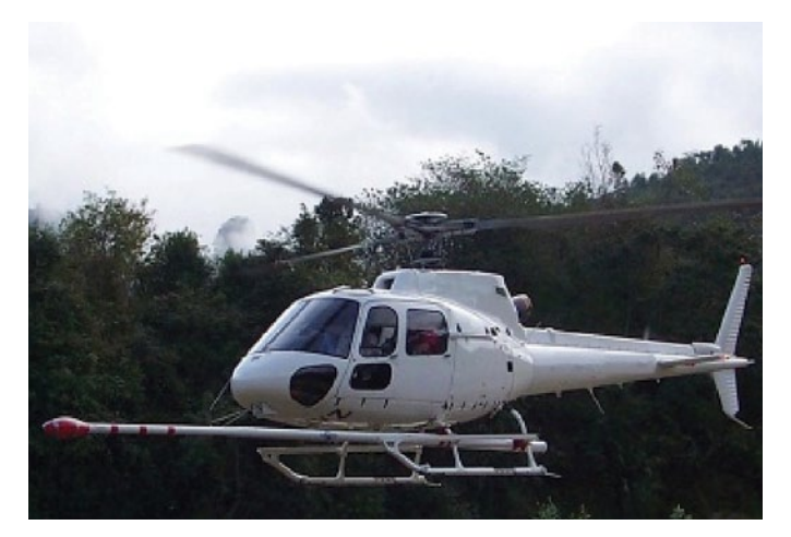
Total-field magnetometer installation in a rigid-boom on an EUROCOPTER AS350B2 A-STAR HELICOPTER