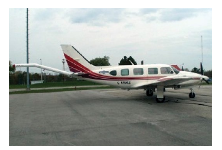
Total-field magnetometer installation in an extended tail-boom on a PIPER PA-31 NAVAJO AIRCRAFT

McPHAR uses several different aircraft to undertake aeromagnetic surveys, in particular the Piper PA-31 Navajo aircraft and the Beech C90 King Air. However, on a project dependent basis we also utilize other aircraft, including the Cessna 206, Cessna 208B Grand Caravan and the Cessna C404 Titan.