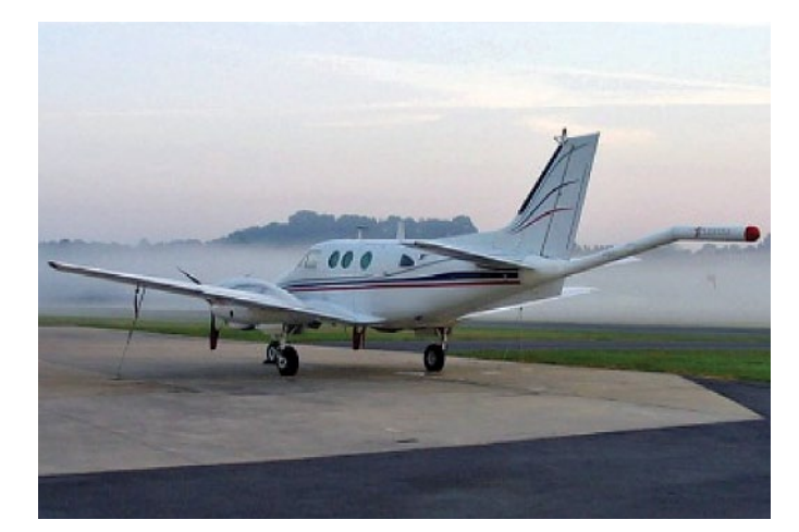
Total-field magnetometer installation in an extended tail-boom on a BEECH C90 KING AIR AIRCRAFT

CANADA - McPHAR INTERNATIONAL CANADA LTD. 36 Ash Street, Uxbridge, ON, Canada L9P 1E5 T. +1 905.852.2828 F. +1 905.852.2899